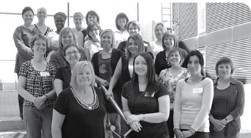
New and returning students in MPN program and three faculty members

Enrolment in the pre-nursing courses has been steadily increasing over the last 8 years as continued on page 3