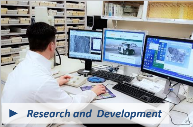
► Research and Development

Students in the BU Geology program enjoy a wide range of activities from field trips and networking events, to taking in a Bobcat's game at the newly renovated Healthy Living Center!