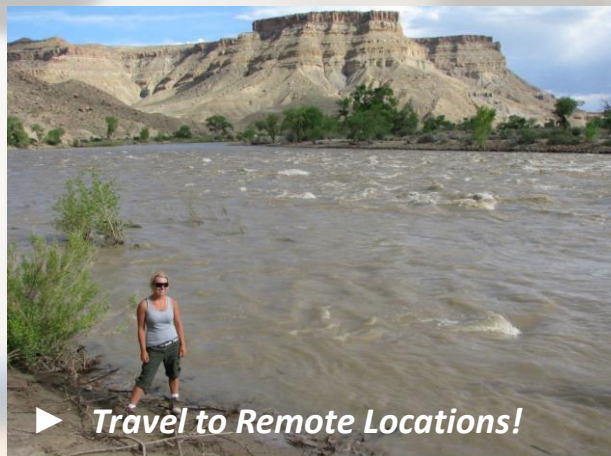
► Travel to Remote Locations!

https://www.brandonu.ca/future-students/apply/high-school/