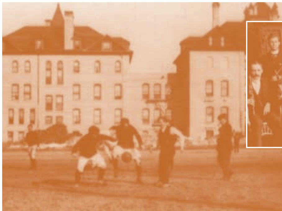
Soccer Game 1911