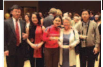
Presidents' Circle members and School of Music students at "A Taste of China"