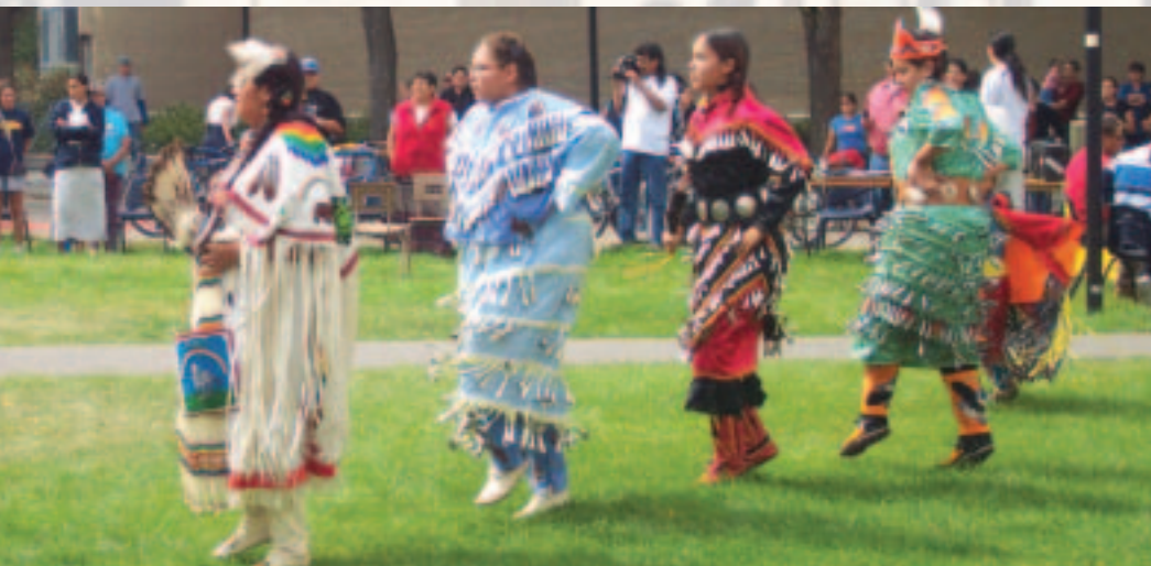
2003 Brandon University First Nation Celebration Pow Wow