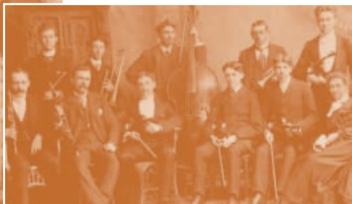
Brandon College Orchestra 1903/04