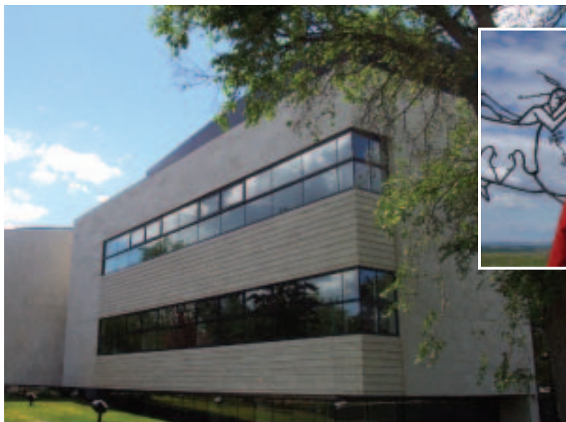
Health Studies Complex