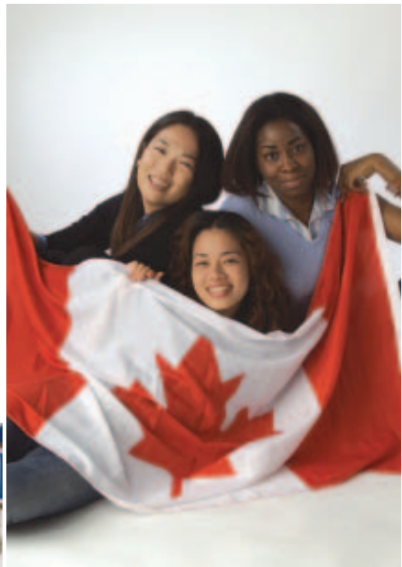
BU International Students