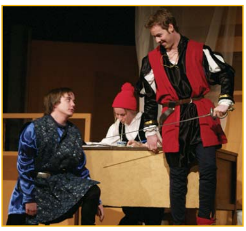
BU Drama students perform Goodnight Desdemona (Good Morning Juliet)