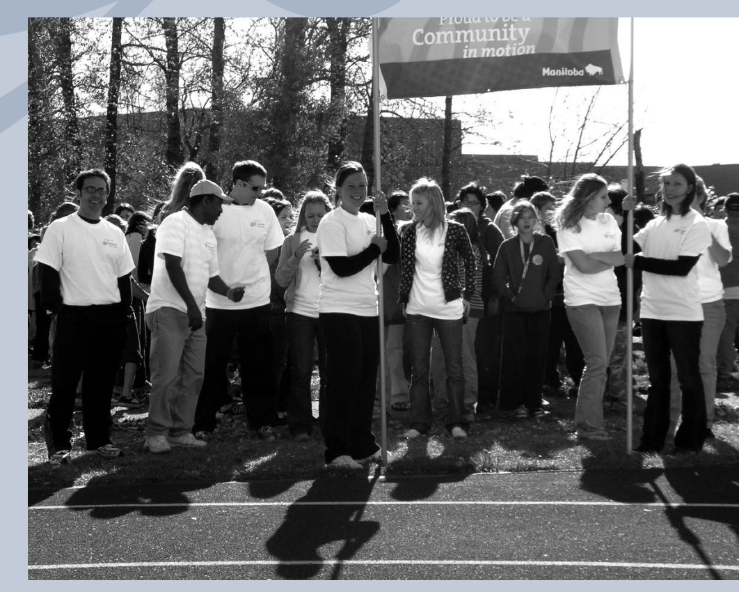
Nursing students taking the lead

On October 3, 2007, Healthy Brandon in motion kicked off their first ever attempt to help Manitoba try and break the World Record Walk Guinness World Record. This record has been previously held in Australia. Although several walks were held through out the City of Brandon, the Department of Nursing students participated at the Sportsplex with the Healthy Brandon in motion. Student nurses from the School of Health Studies helped manage the walk by leading the group of several hundred people. Both young and old participated along with the occasional dog. The track at the Sportsplex was the designated route. Every individual had to successfully walk the track four times to be counted. Student nurses aided as spotters for the walk and assisted at the registration table. The weather cooperated by being bright, sunny and warm, as participants enjoyed completing the challenge. The final results of the World Record Walk will be finalized in January 2008.