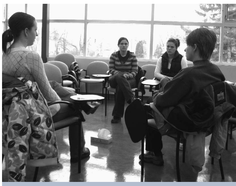
Therapeutic Groups students participate as group members while classmates act as co-facilitators

knowledge and skills invaluable to the clients, agencies and health care settings they will serve.