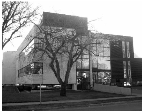
Over 400 full-time and part-time students in the School of Health Studies are currently housed in the Health Studies Complex

In honour of many years as partners and leaders in nursing education, Brandon University is hosting a celebration on October 17, 18, and 19 in conjunction with Homecoming '08. Students, faculty and staff are invited to attend and share their memories while re-connecting with their colleagues as Brandon University's School of Health Studies moves forward into the next 50 years.