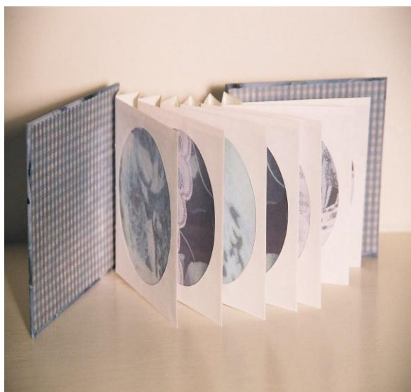
Concertina book with CD covers and fabric collages