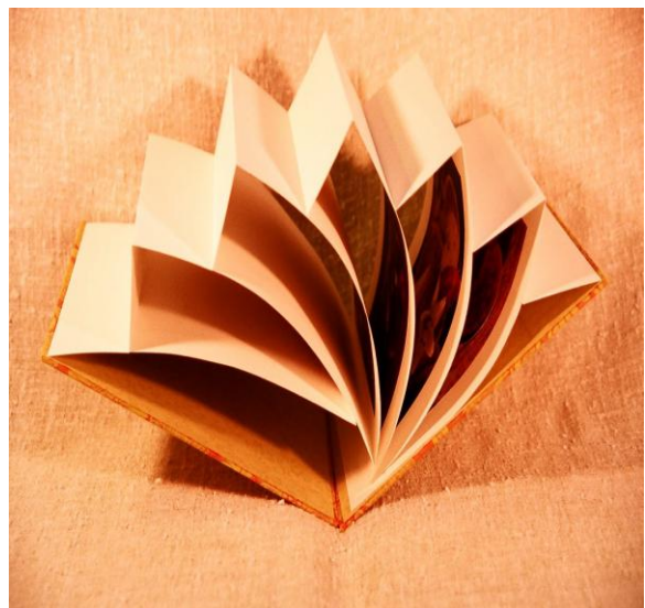
Flag book with collages