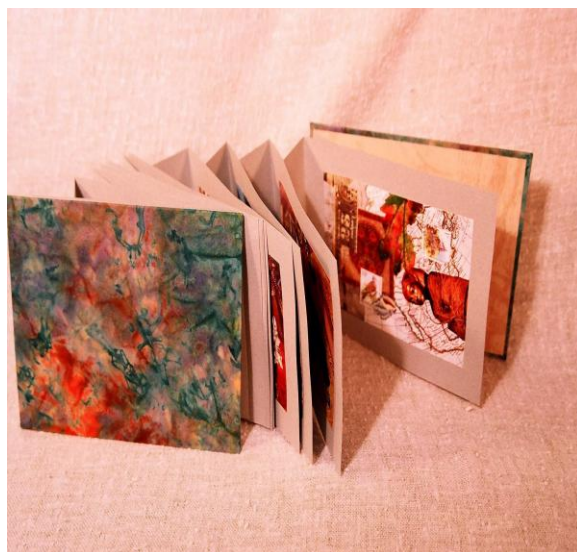
Flag book with collages and batik cover