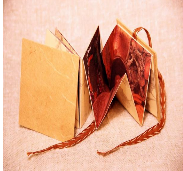
Origami book with collages