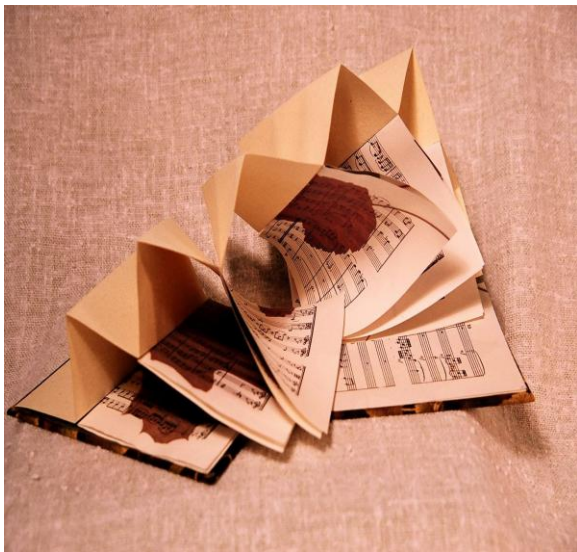
Concertina book recycling sheet music