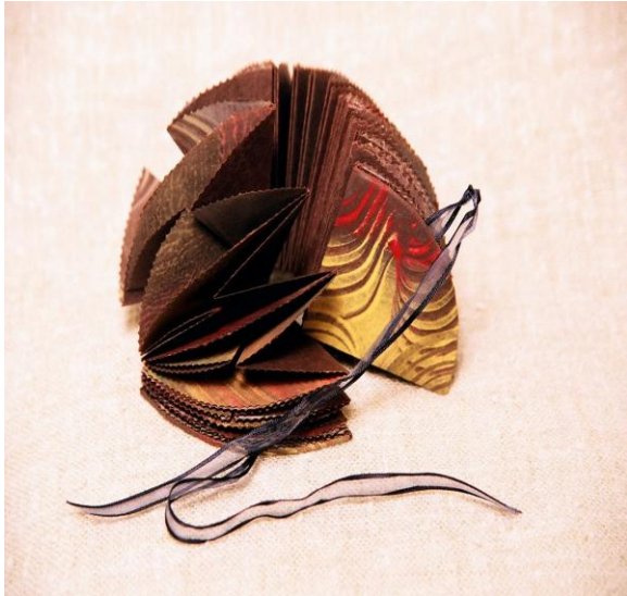
Circle book of paste-paper

The following examples of book art have been provided courtesy of book-artist Elaine Rounds, Brandon, Manitoba.