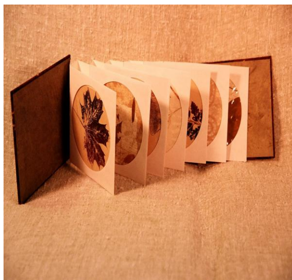
Concertina book with CD covers and nature prints